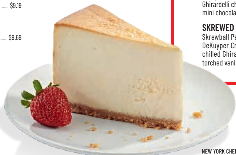
NEW YORK CHEESECAKE