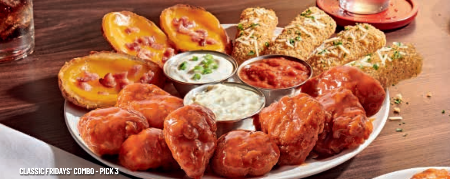
CLASSIC FRIDAYS® COMBO - PICK 3