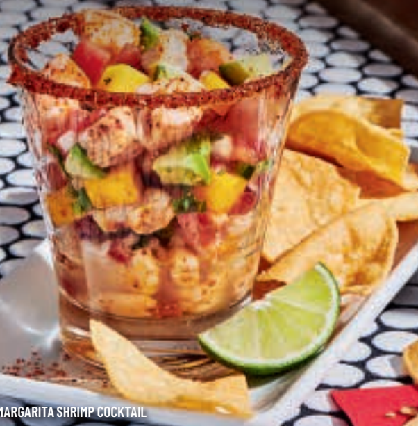
MARGARITA SHRIMP COCKTAIL