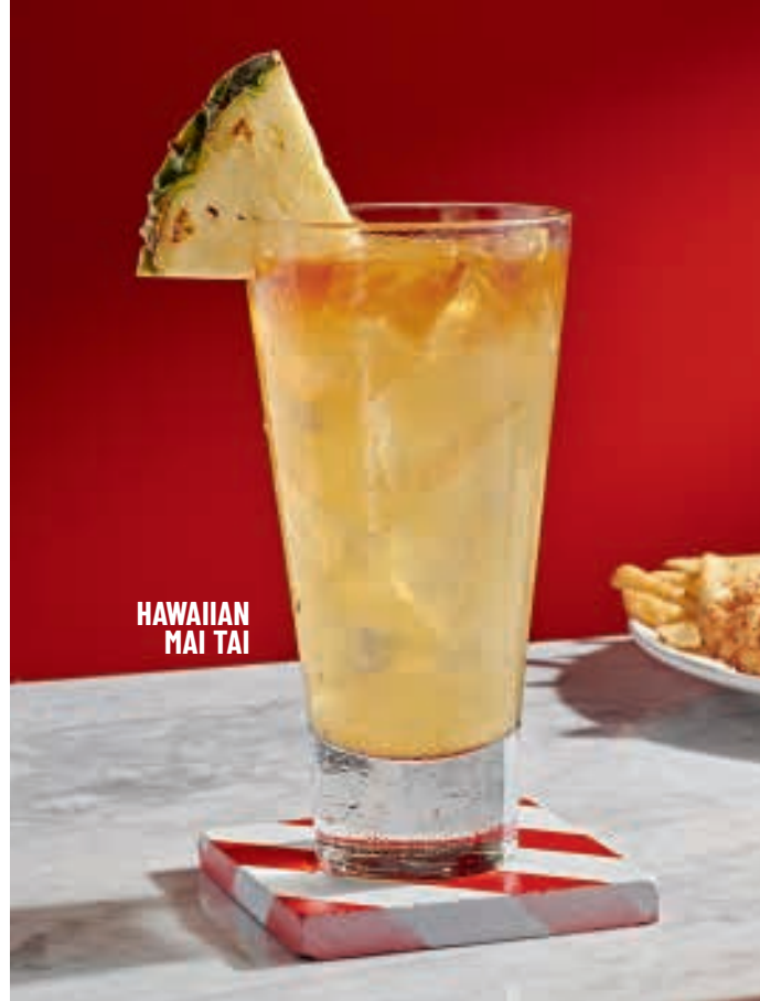
HAWAIIAN MAI TAI

LAVENDER FIELDS LEMON DROP MARTINI cal 260 SKYY Vodka, Cointreau, lemon, lavender, simple syrup